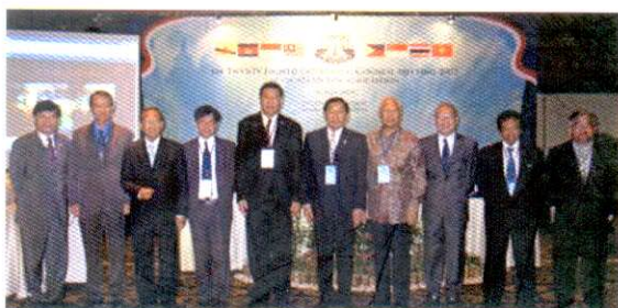
← President ALA with Chairman of ALA member country and the ALA Secretary-General