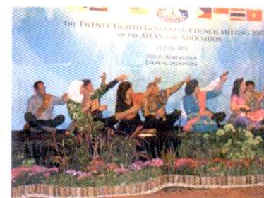
Malaysian cultural performance →