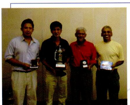
Some of the prize winners ▶