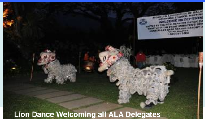
Lion Dance Welcoming all ALA Delegates

The welcome Dinner on the 31 st July 2008 hosted by the Hon. Senator Datuk Zaid Ibrahim, the then Minister in the Prime Minister Department.