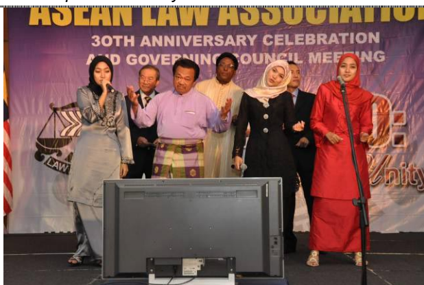
Cultural performance by ALA Malaysia