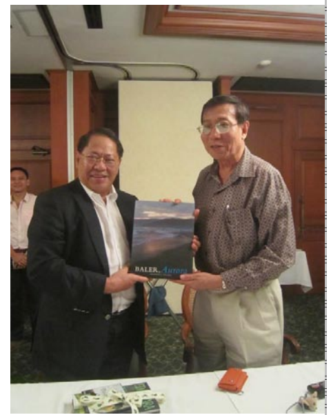
Senator Ed Angara presented a gift to Justice Pornpetch Wichitcholchai