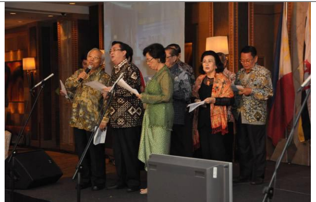
Cultural performance by ALA Indonesia