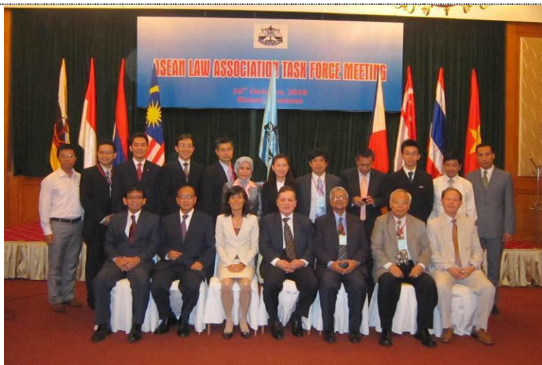
Participants of the 1 st ALA Task Force Meeting took group photo with ALA President, ALA Secretary General and ALA Task Force Chairman.