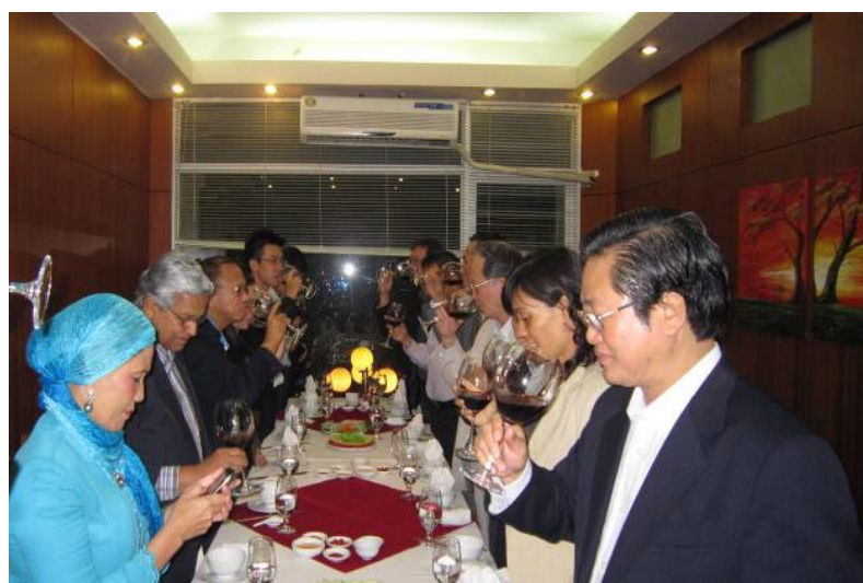
Participants of the 1 st ALA Task Force Meeting at the Farewell dinner party hosted by ALA Vietnam.