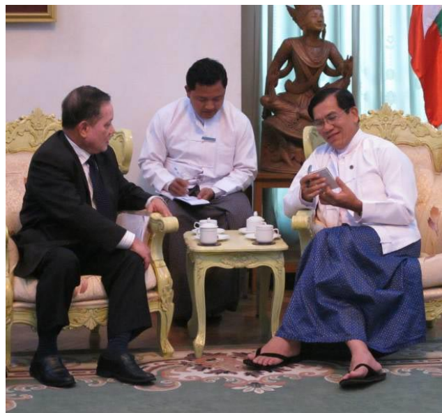
Hon. Pham Quoc Anh, ALA President discussed with Myanmar Minister of Foreign Affairs.

The Myanmar Minister of Foreign Affairs and Attorney General expressed their support for Myanmar lawyers to join ALA and promised to try their best to encourage Myanmar lawyers to join ALA.