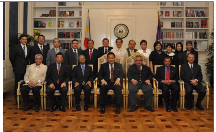
Courtesy Call on Chief Justice Renato Corona, Chairman of ALA Philippine National Committee, for August 6, 2010 Testimonial Dinner.