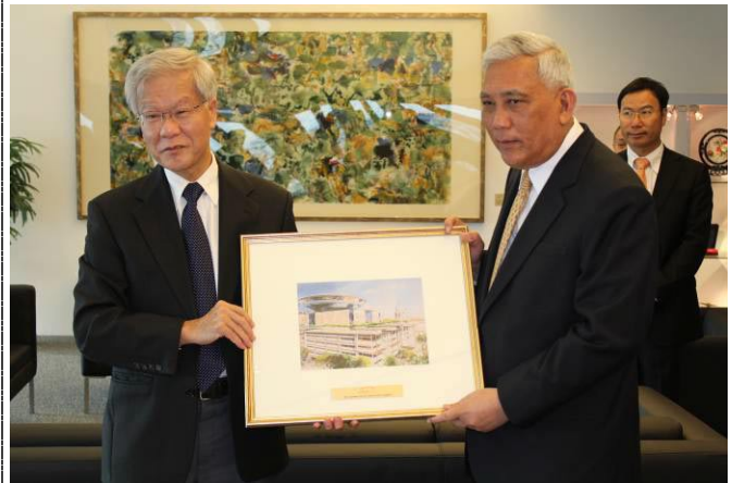
Hon. Chief Justice Chan Sek Keong presented the gift (the painting of Singapore Supreme Court Building) to Hon. Chief Justice Sobchok Sukharomna.