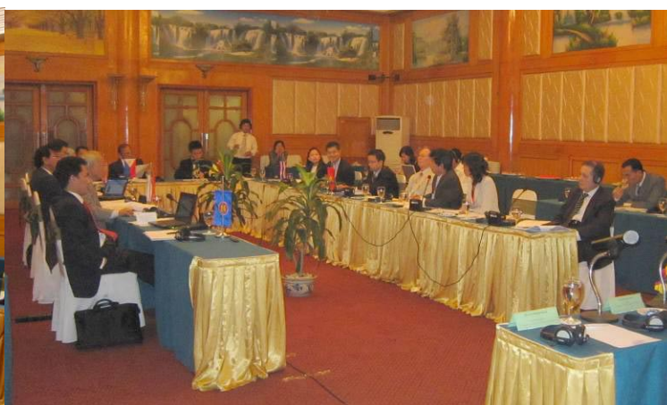
Participants discussing at the 1 st ALA Task Force Meeting