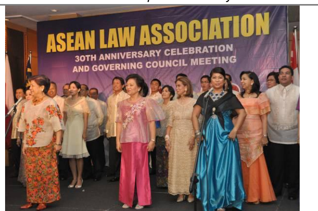
Cultural performance by ALA Philippines