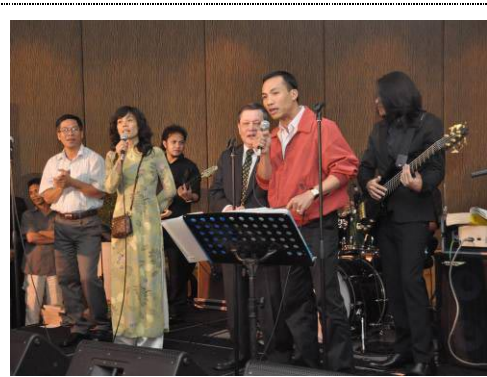
Cultural performance by ALA Vietnam