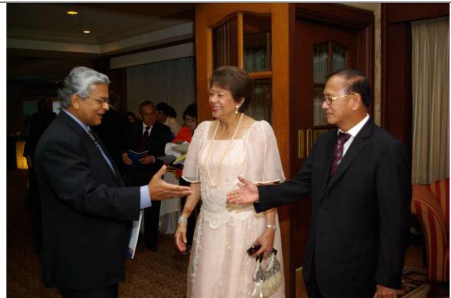
August 6, 2010 Testimonial Dinner in honor of new ALA Philippine National Committee Chairman, Chief Justice Renato Corona.