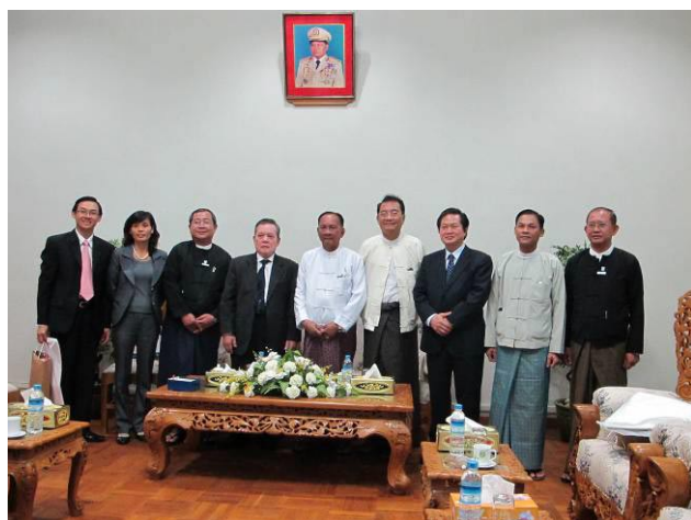
The delegation took photo with Attorney General cum President of Lawyers Association of Myanmar.