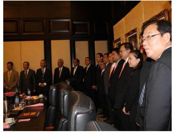
Group photo after the presentation made by the Hon. Chief Justice of Malaysia at Chief Justice's Chambers.