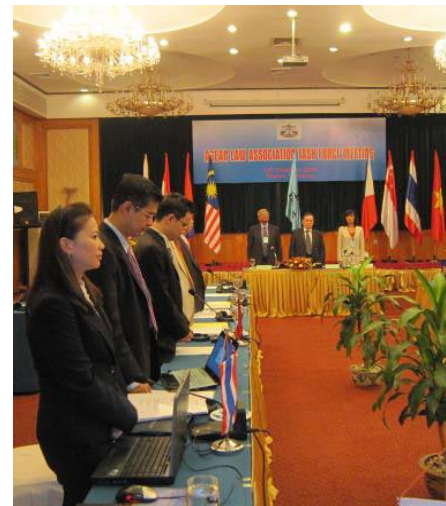
Participants of the 1 st ALA Task Force Meeting standing for the ALA anthem.

The meeting was followed by a dinner hosted by the ALA President, also the President of the Vietnam Lawyers Association.