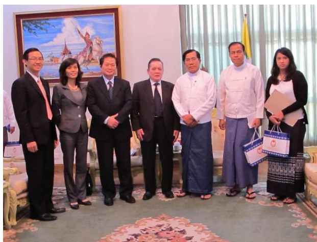
The delegation took photo with Minister of Foreign Affairs of Myanmar.