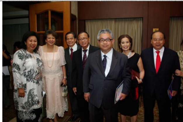
August 6, 2010 Testimonial Dinner in honor of new ALA Philippine National Committee Chairman, Chief Justice Renato Corona.

Group photo includes the ALA Philippine National Committee officials.