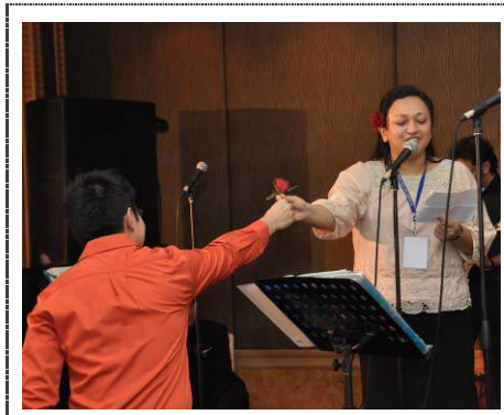
Cultural performance by ALA Singapore