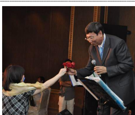
Cultural performance by ALA Thailand