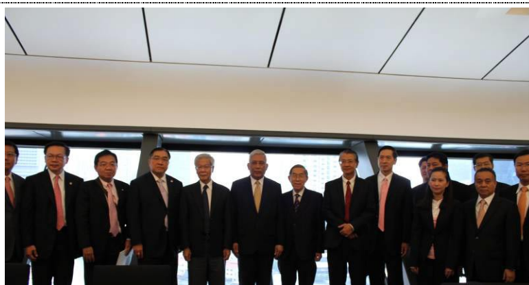
Hon. Chief Justice Chan Sek Keong took a group photo with Hon. Chief Justice Sobchok Sukharomna – Chairman of National Committee of Thailand and Thai delegation.

The Court of Justice of Thailand attaches great importance to set up e-court systems in order to ensure the access to justice. The Supreme Court of Singapore has been playing the leading role in case management and introducing the Electronic Filing System (EFS) for better management of court documents.