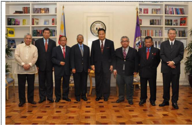
Courtesy Call on Chief Justice Renato Corona, Chairman of ALA Philippine National Committee, for August 6, 2010 Testimonial Dinner.