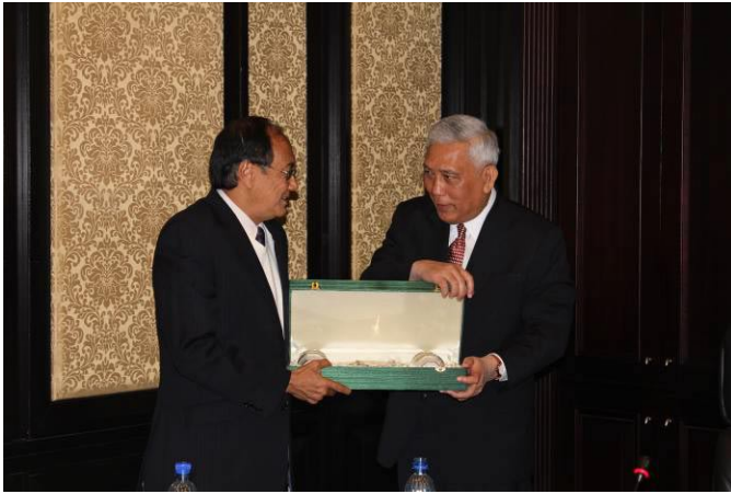
Hon. Chief Justice Sobchok Sukharmorna presented the token of appreciation to the Chief Justice of Malaysia.

The visit has raised more cooperation between ALA member countries; especially in the area of judicial cooperation between Thailand and Malaysia. The aim of this effort is to create a closer cooperation among ASEAN Supreme Court that will result in a better functioning, more efficient, and access to justice of the people. The visit has proved its value especially that it is an opportunity for the Thai judiciary to exchange its views with Malaysian Judiciary about Islamic Law and Sharia Court.