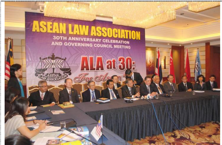
Press meeting after the 32 nd ALA Governing Council Meeting in Manila

The main contents of the meeting were the submission and discussion of the two proposals on ASEAN Charter implementation, one of which was "ASEAN Charter: Dispute settlement mechanism" and another was "Proposed ASEAN protocol on enforcement of arbitral award" and the place and date of the next Governing Council meeting. It was decided that the two proposals were referred to the Task Force meeting to deliberate more closely then report to the Governing Council at the next meeting, so that ALA can move forward on a consensual basis. It was also decided that the next Governing Council meeting would be held in Thailand in February or March 2011.