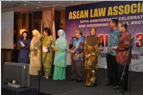
Cultural performance by ALA Brunei