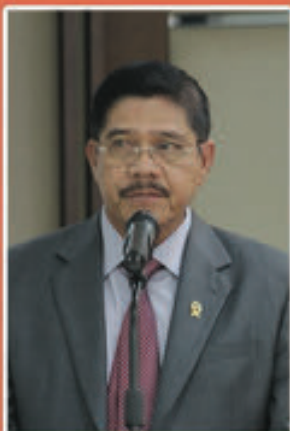
The Hon. Chief Justice Dr. M. Hatta Ali opened the Training

The Supreme Court of Indonesia in collaboration with the Secretariat General of ASEAN Law Association and ALA Indonesia organized the first ASEAN Judicial Training at the Training Center of The Supreme Court of Indonesia at Megamendung, Bogor, Indonesia. This training program initiative was the implementation of the commitment of Indonesia's Chief Justice The Hon. Dr. M. Hatta Ali to The ASEAN Chief Justices at the 2 nd Chief Justices' Meeting in Kuala Lumpur, September 19, 2014.