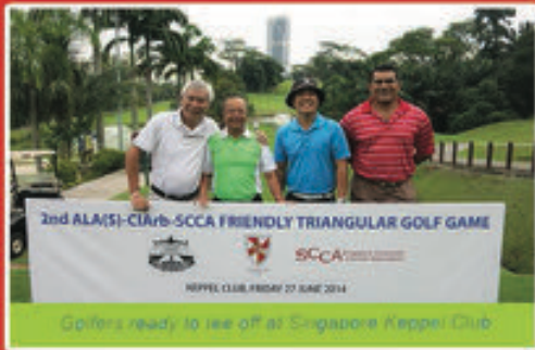
Golfers ready to tee off at Singapore Keppel Club