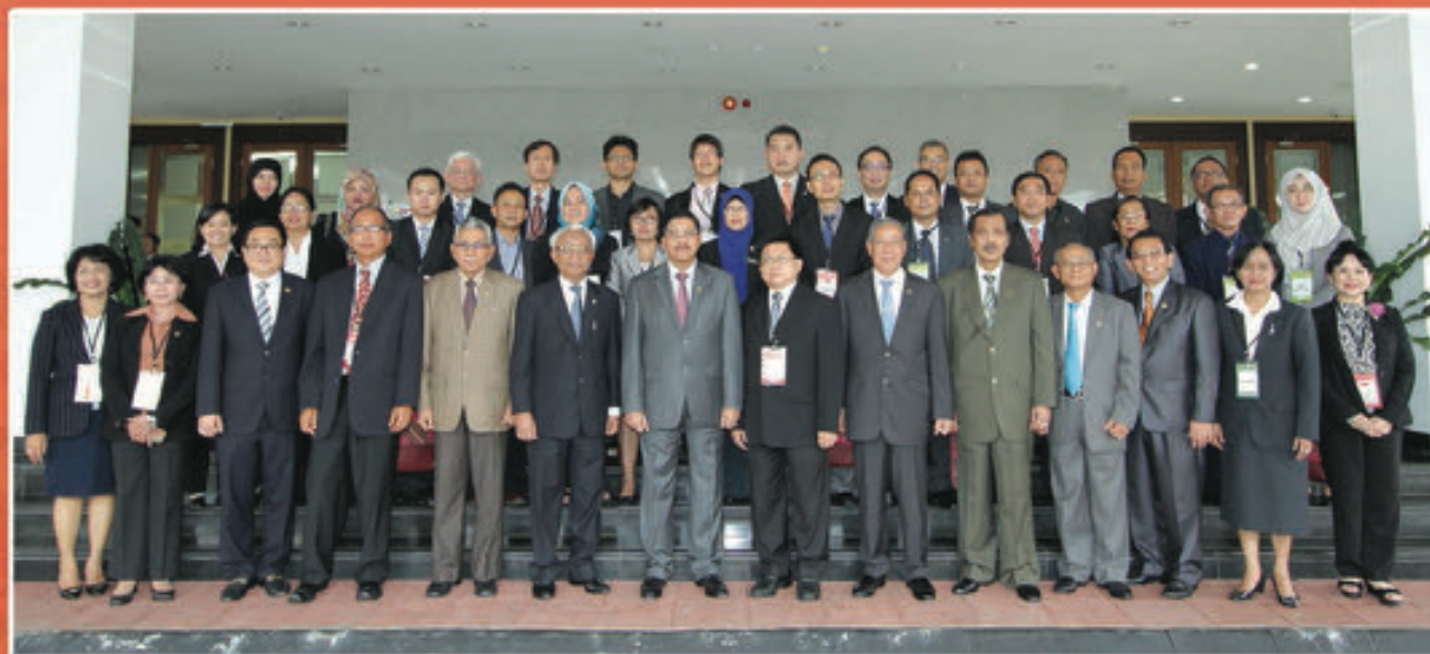
Training Participants with the Officials of The Supreme Court of Indonesia and ALA