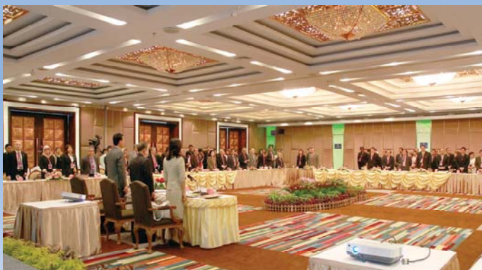
Participants of the 33 rd ALA Governing Council Meeting standing for the ALA anthem