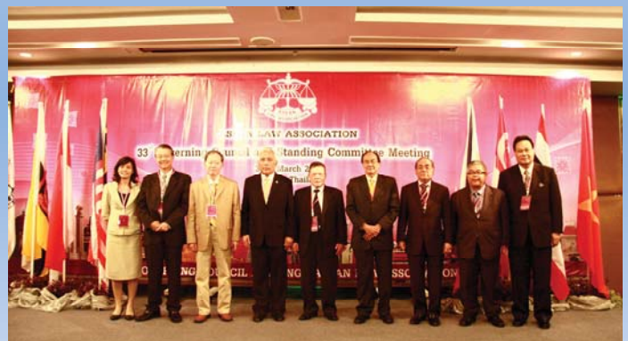
Heads of delegations took group photo with the ALA President and ALA Secretary General