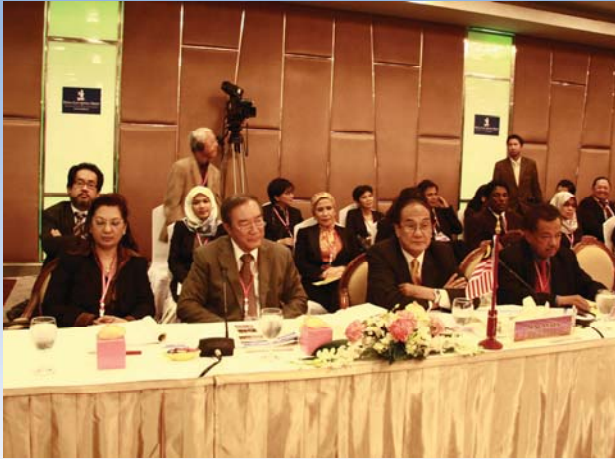
Delegation of ALA Malaysia