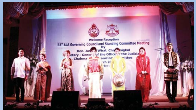
Thai artists performed songs of ALA Member Countries at the Welcome Reception