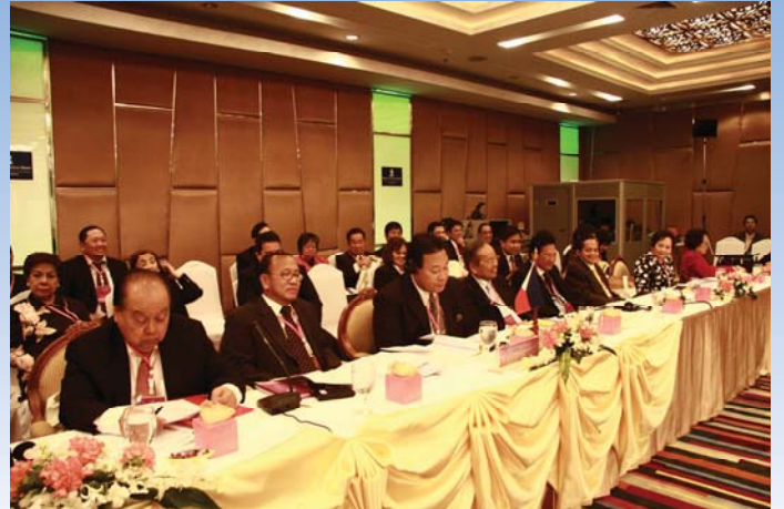
Delegation of ALA Philippines