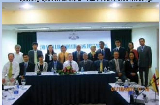
Participants of the 2 nd ALA Task Force Meeting took group photo with ALA President, ALA Secretary General and ALA Task Force Chairman.