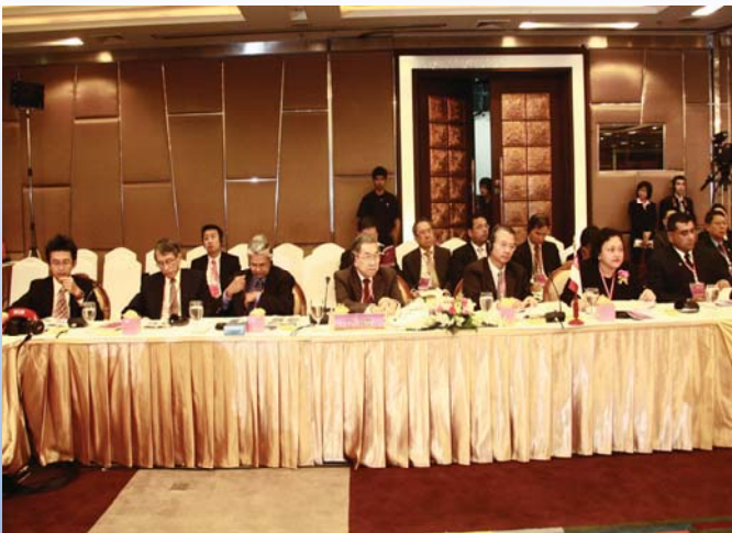
Delegation of ALA Singapore