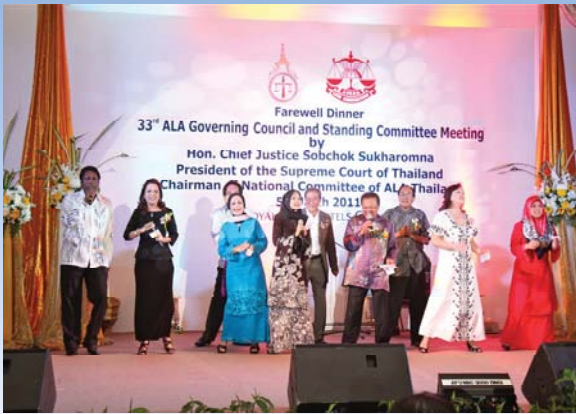
Cultural performance by ALA Malaysia