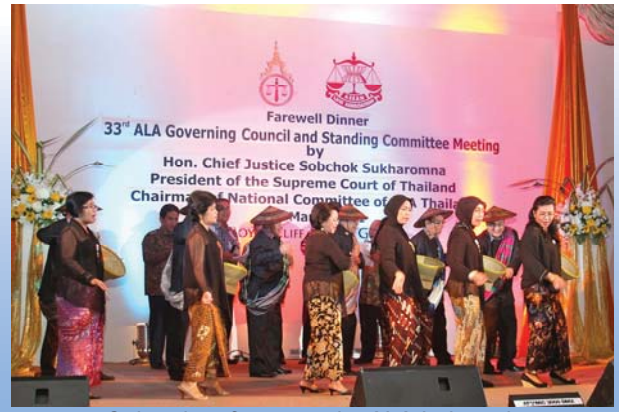
Cultural performance by ALA Indonesia