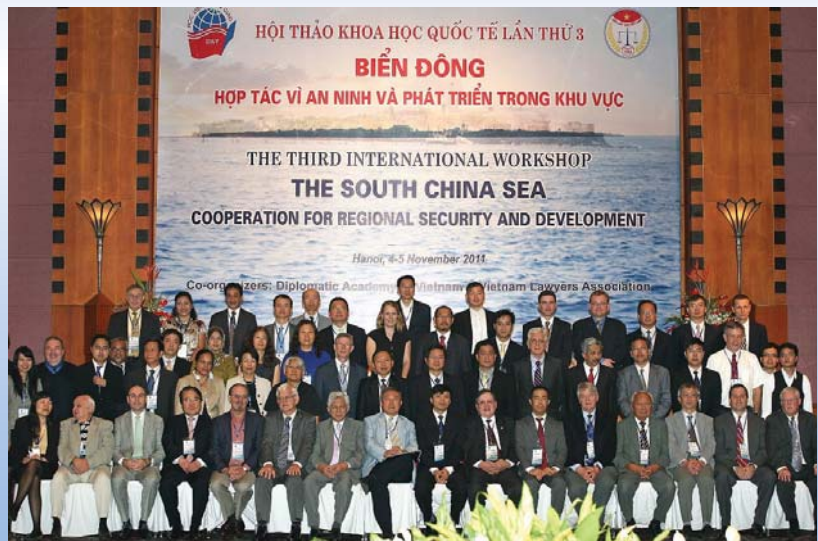
Participants of the 3 rd Workshop on the South China Sea took group photo

This third international workshop provided an excellent opportunity to assess the current situation in the South China Sea from an interdisciplinary perspective, to explore areas confidence building measures under the just adopted ASEAN-China Guidelines to Implement the Declaration on Conduct of Parties in the South China Sea (DOC) and to consider and discuss measures to maintain peace and stability in the area while promoting regional cooperation. At the same time, China and Vietnam have the opportunity to move from confrontation to cooperation under their bilateral Agreement on Basic Principles for the Settlement of Sea Issues.