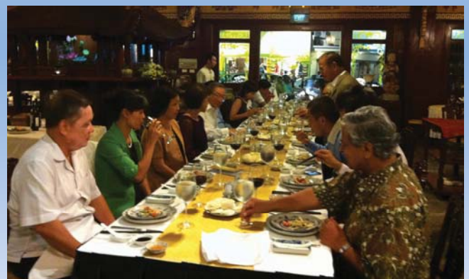
Participants of the 2 st ALA Task Force Meeting at the Farewell dinner party hosted by ALA Vietnam