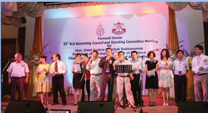
Cultural performance by ALA Vietnam