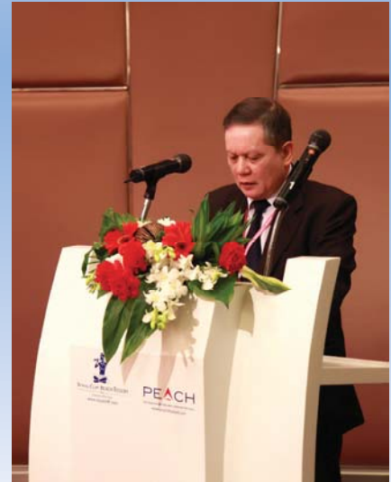
Hon. Pham Quoc Anh, ALA President delivering opening speech at the 33 rd ALA Governing Council Meeting.

It was decided that instead of setting up a new Committee, the Task force Group would continue their work to draft the guidelines on best practices of arbitration in ASEAN. It was also decided that the topics for General Assembly workshops would be in general based on the topics proposed by different standing committees at 33 rd Governing Council meeting and that ALA Indonesia would elaborate and send the list of proposed topics to all member countries for final approval. The Governing Council meeting has agreed to hold the next General Assembly in Bali, Indonesia from 14 to 19 of February 2012.