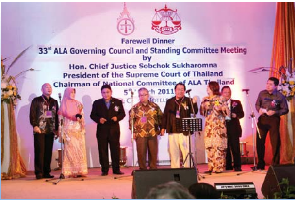
Cultural performance by ALA Brunei