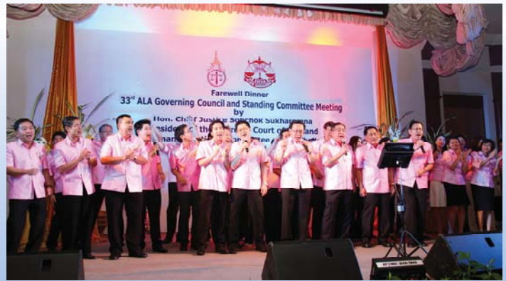
Cultural performance by ALA Thailand