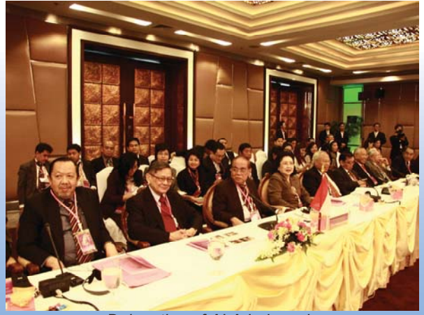
Delegation of ALA Indonesia