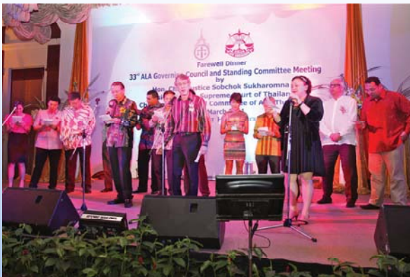
Cultural performance by ALA Singapore