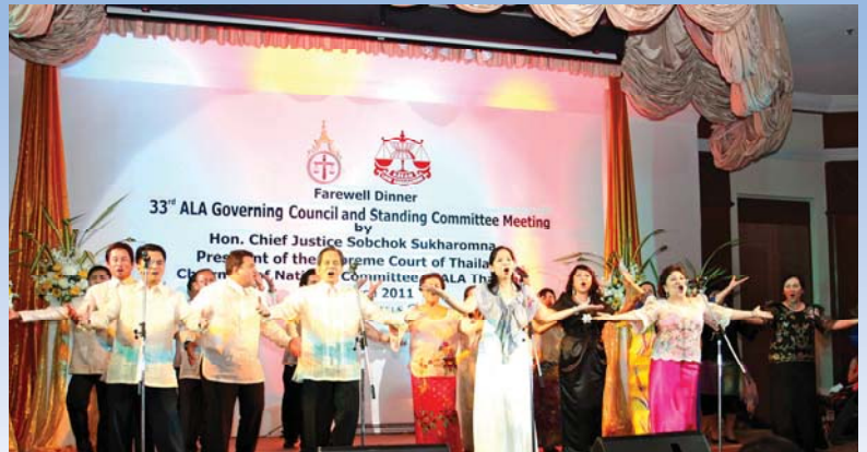
Cultural performance by ALA Philippines