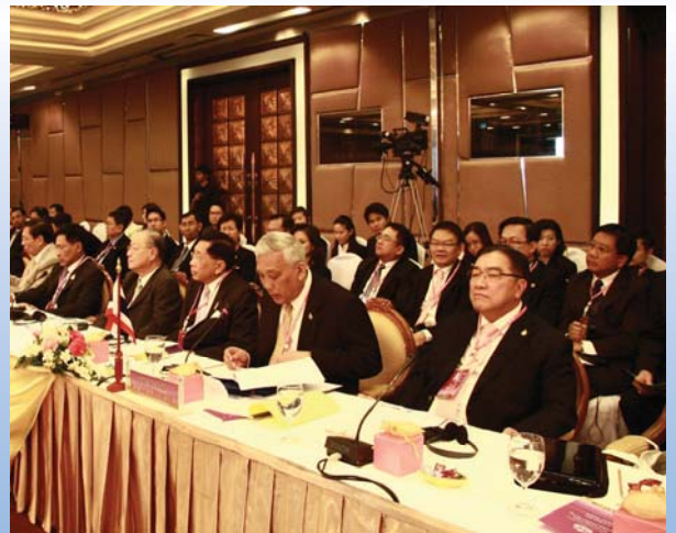
Delegation of ALA Thailand