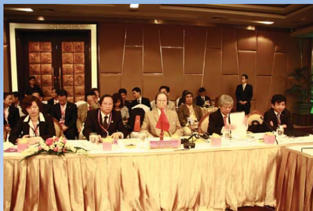
Delegation of ALA Vietnam