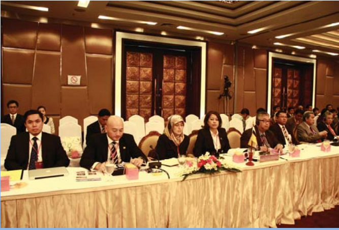
Delegation of ALA Brunei