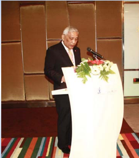
Hon. Chief Justice Sobchok Sukharmna President of the Supreme Court of Thailand, Chairman of National Committee of ALA Thailand delivering welcome speech at the 33 rd ALA Governing Council Meeting

The main contents of the meeting were discussion of the workshop topics of the Bali General Assembly in 2012 and discussion of a short paper on dispute settlement mechanism between private parties in ASEAN submitted by the Task Force Group, which