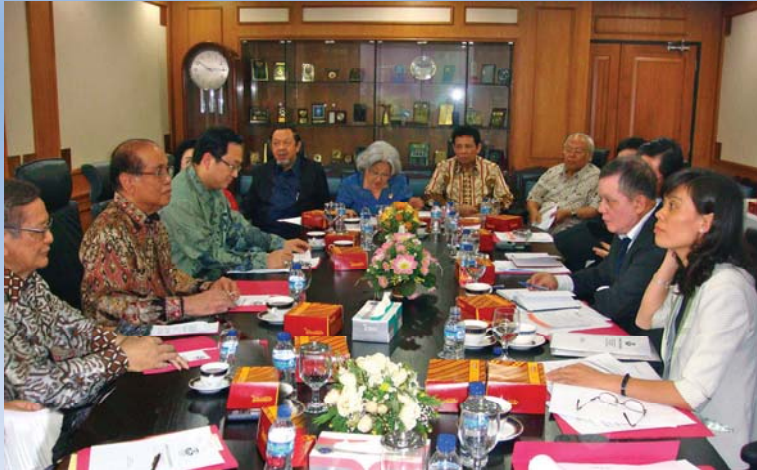
Meeting between ALA President, ALA Secretary General and ALA Indonesia representatives