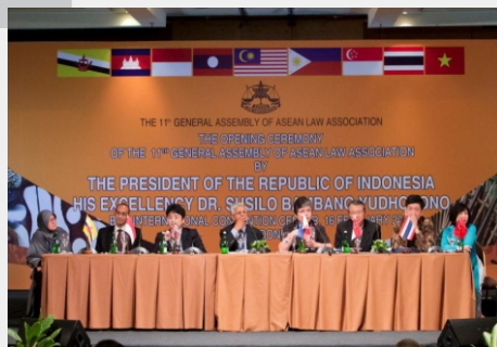
Speakers for Workshop 1 entitled Establishment of Center of ASEAN Law Information