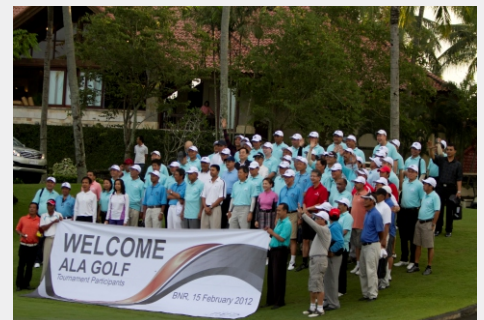
Participants of the ALA Championship Golf Tournament held at the Nirwana Golf & Country Club, Bali