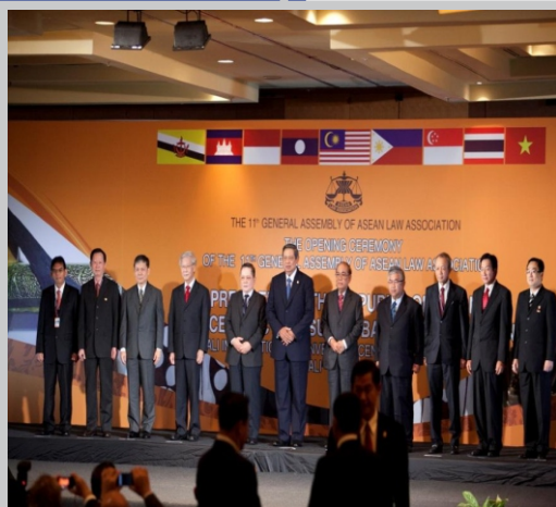
The President of the Republic of Indonesia, Dr. Susilo Bambang Yudhoyono as seen with the Heads of ALA Delegations

The upcoming 35 th ALA Governing Council will be held on 23-25 August 2013 in Singapore.