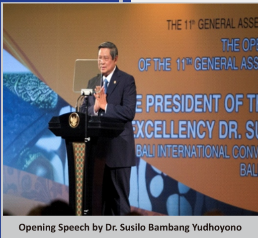
Opening Speech by Dr. Susilo Bambang Yudhoyono

15-18 February 2012: The 11 th ALA General Assembly & 34 th ALA Governing Council