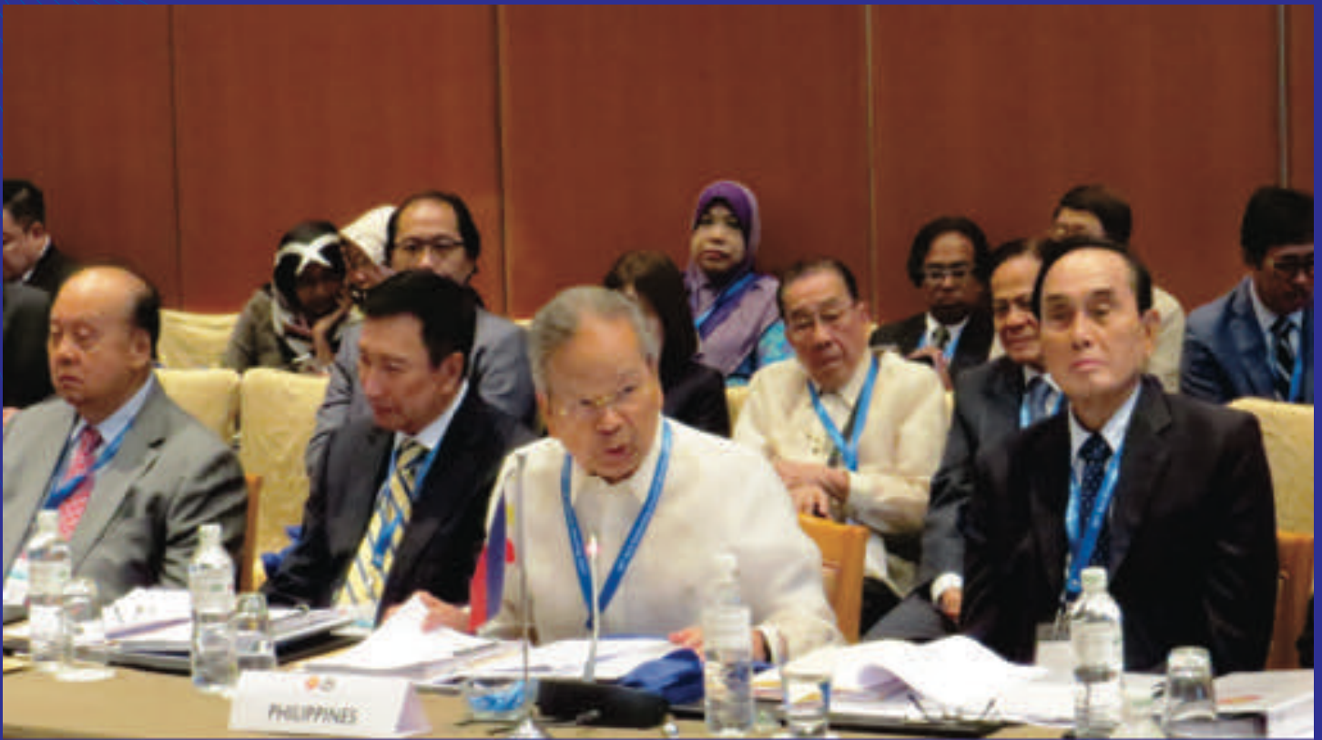
Audience of Heads of Delegation with the Sultan of Brunei